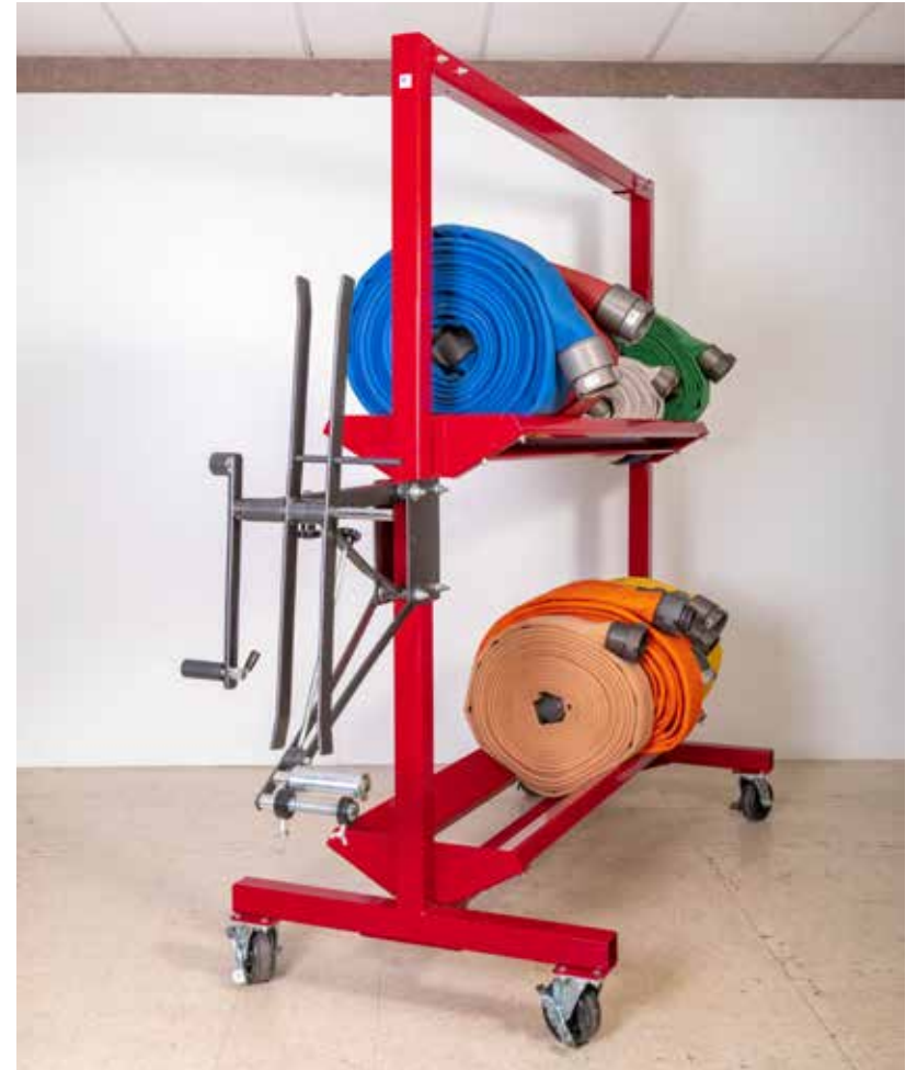
Shown: Hose winder attached to the Mobile Hose Cart (sold separate)

Please visit readyrack.com/guides to find more information and other assembly instruction guides.