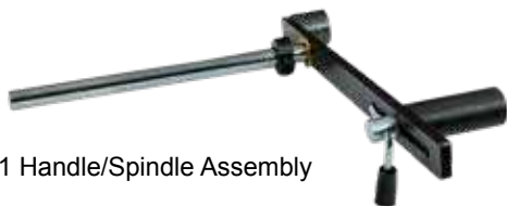
HW-1 Handle/Spindle Assembly