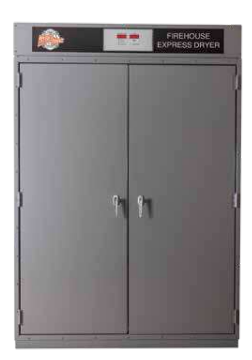
Actual dry times vary depending on local environmental conditions