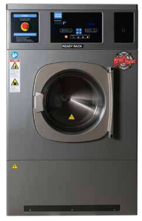
**See page 7