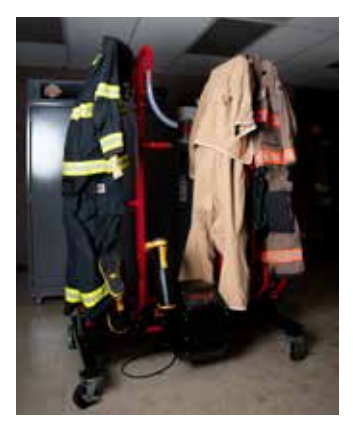
Gear not included