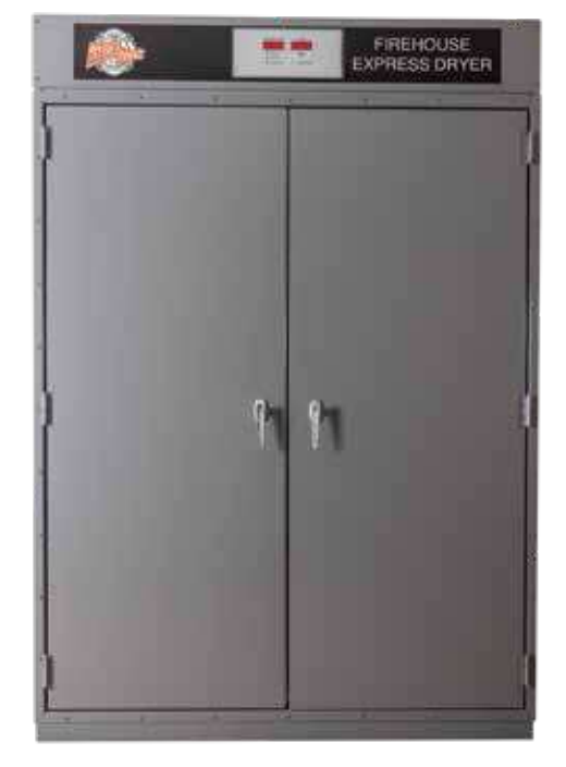
Actual dry times vary depending on local environmental conditions