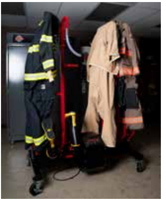
Gear not included